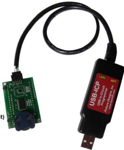
Example User Target Board (Not Part of Kit)

The target connector is a standard 2mm pitch, 10-pin, shrouded header available from numerous suppliers. Shrouded connectors should be utilized in order to protect the pins and ensure proper connector insertion.