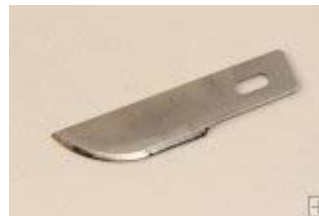
No. 10 Blade 100 pk