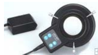
White LED Ring Light with Brightness and Sector Control