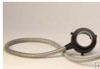
Fiber Optic Ringlight 2.31" ID