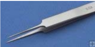
Tweezer Pattern 5-SA Technik