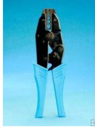
Crimping Tool Frame Only