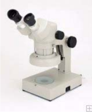
DSZ-70TL Stereo Zoom Microscope 20x-70x