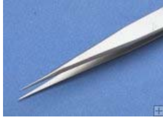
Tweezer Pattern 3C-CS