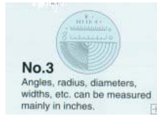
No.3 Reticle Scale (for use with M1207 & M1210 Loupes)