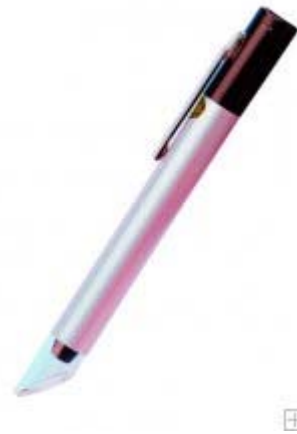
Pocket Microscope 25X