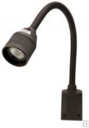
Sirus Quartz Halogen Task Light- 20 1/2" Flex Arm