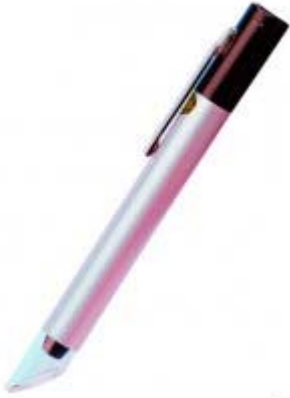
Pocket Microscope 25X