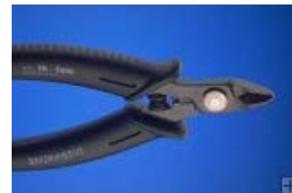
TR-5000-R Niptec Cutter, AWG 14