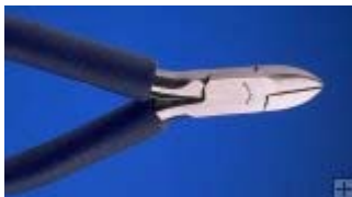
5" Standard Oval Head Cutter, Flush