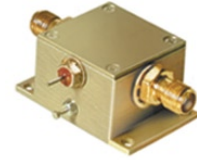
CASE STYLE: EEE132