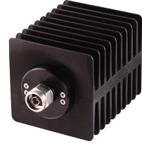
CASE STYLE: GH986