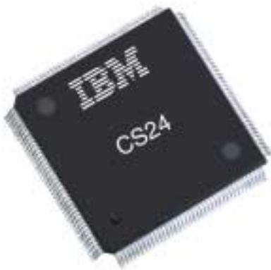
Figure 1: IBM's single-chip digital audio/video decoders integrate advanced features for high-performance solutions.