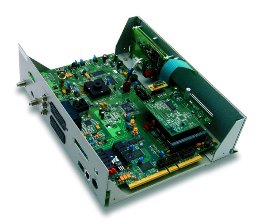
CX24153/4/6 Development Platform

The CX24153/4/6 IC family is integrated into a fully engineered interactive TV STB reference development system that implements third-party interactive middleware/RTOS platforms and provides complete STB functionality. The hardware platform comes equipped with fully integrated OpenTV, Alticast, Nucleus+, pSOS and VxWorks runtime libraries and driver software components. A mature and robust hardware abstraction layer is assured by re-use of core driver libraries developed on early generation ICs. The development platform set-top box hardware is designed with a two-layer PCB configuration and a variety of PSTN modem options. A choice of two robust tool chain development environments are supported for code developers including the ADS 1.2 from ARM, Inc. and Tornado 2.2 from WindRiver Systems, Inc. Conexant offers a complete development code solution that has been tightly integrated with both third party tool chain environments.