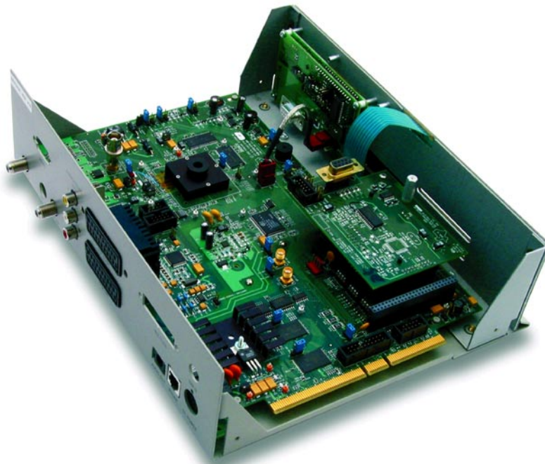
CX24153/4/6 Development Platform

The CX24153/4/6 IC family is integrated into a fully engineered interactive TV STB reference development system that implements third-party interactive middleware/RTOS platforms and provides complete STB functionality. The hardware platform comes equipped with fully integrated OpenTV, Alticast, Nucleus+, pSOS and VxWorks runtime libraries and driver software components. A mature and robust hardware abstraction layer is assured by re-use of core driver libraries developed on early generation ICs. The development platform set-top box hardware is designed with a two-layer PCB configuration and a variety of PSTN modem options. A choice of two robust tool chain development environments are supported for code developers including the ADS 1.2 from ARM, Inc. and Tornado 2.2 from WindRiver Systems, Inc. Conexant offers a complete development code solution that has been tightly integrated with both third party tool chain environments.