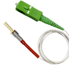
PD300-003-3xx SC/APC Pigtail