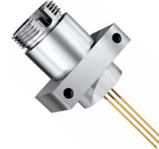
PD300-003-5xx FC Receptacle