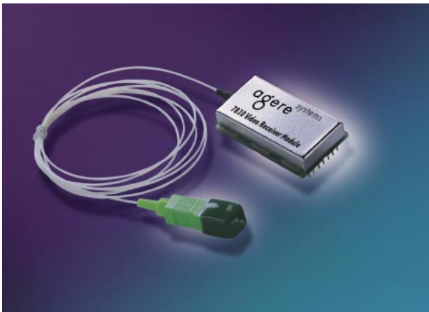
The broadband 7810 video receiver module is a versatile, state-of-the-art solution for a variety of network applications.